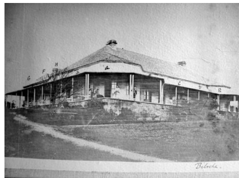
Biloela – on Cockatoo Island