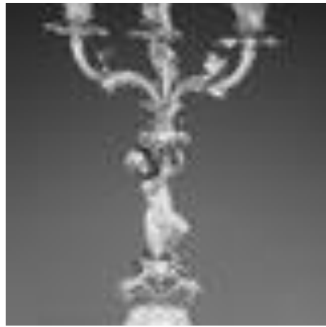
The candelabrum – on display at the Powerhouse Museum

Thanks, too, to family members (and to some non-family members as well) who hold family memorabilia for making contact with us. Slowly but surely we are building up a picture of where much of the family memorabilia resides. And it's amazing how far from home it's wandered over the years.