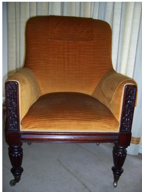
William Macquarie’s chair