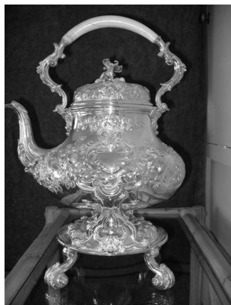
The companion tea kettle – lives in Queensland

Imagine our surprise then, to learn in May that a Sydney member of our family still holds the companion candelabrum; then out of the blue in June we learn that still more of the gift - the matching tea kettle - is still in family hands; with a family member in Queensland. Needless to say we're still searching for the rest of this magnificent gift given to Charles on 26 September 1855.